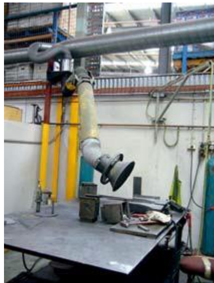
Welding fumes are extracted via flexible, locatable forced extraction and ventilation system.