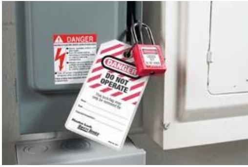
Tag and lock