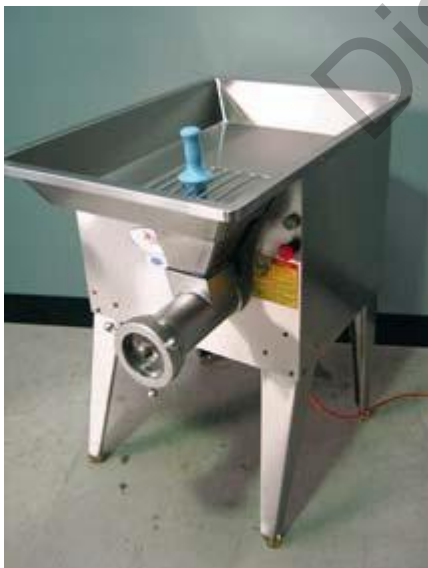
The narrow throat of the mincer prevents a person's hand from accessing the hazard.

Administrative controls, such as effective supervision, instruction and training, are required to ensure that only one key is available for the system, and the key is not removed from the access gate or guard by a second operator while a person is exposed to the danger area of the plant. Operations such as maintenance, repair, installation service or cleaning may require all energy sources to be isolated and locked out to avoid accidental start-up.