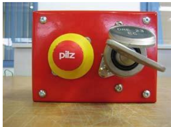
Captive key systems: The key cannot be removed unless it is in the off position. The same key is used to unlock the access gate. Only one key per system is retained by the locking mechanism.