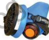
Particle half face respirator