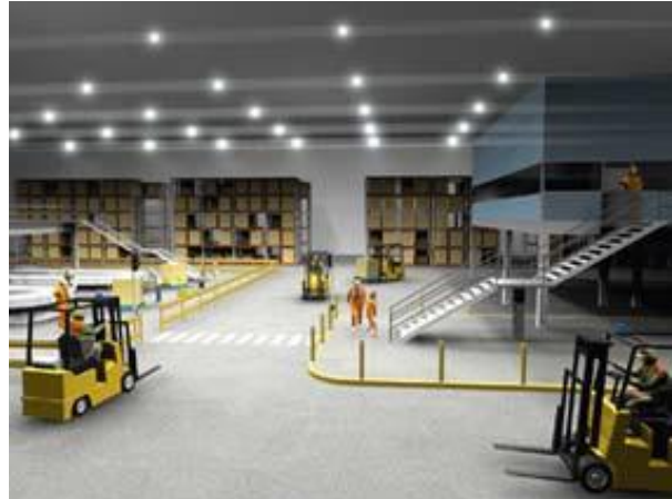
Mobile plant operated in areas where people work may cause injury through collision. Traffic control and segregation are forms of control.