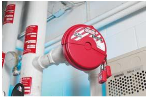
Valve lock and tag