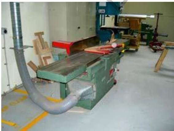
Woodworking dust generated by a buzzer is removed via forced extraction and ventilation.